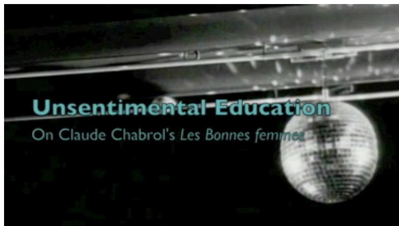
Figure 1: Screenshot from Unsentimental Education (Catherine Grant, 2009)

“[T]here is always a personal edge to the mix of intellectual curiosity and fetishistic fascination.” (Mulvey 2006, 145)